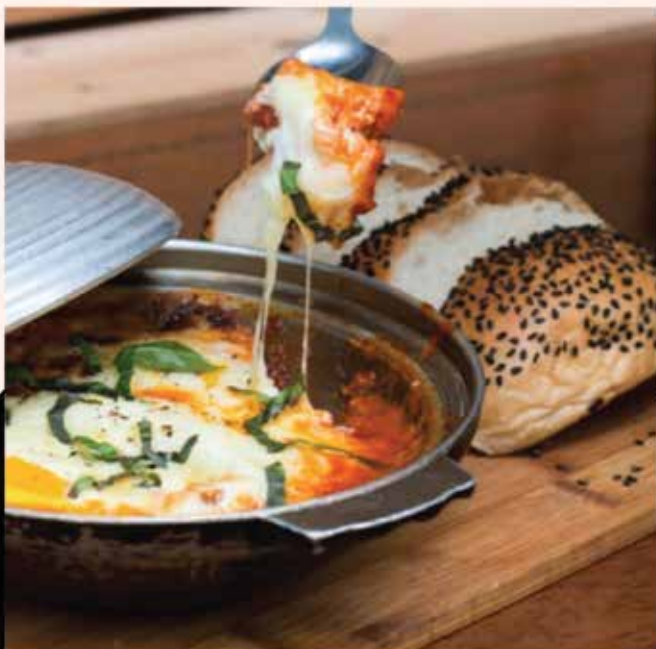
SHAKSHUKA 16 BAKED EGGS IN TOMATO SAUCE, POTATOES, BASIL MELTED CHEESE.