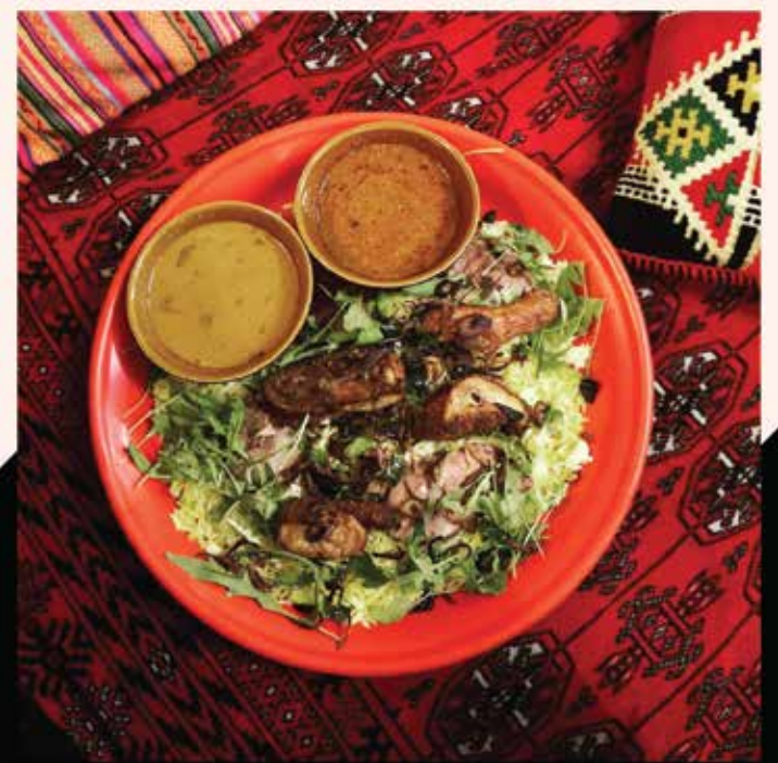
BRIYANI DULANG 60 FEEDS 3-4 PAX BASMATHI RICE, FRIED CHICKEN, CMOKED LAMB, WATERCRESS, CUCUMBER, HOUSEMADE SAMBAL & CURRY