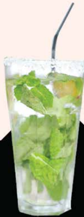
LIME MINT SODA 8