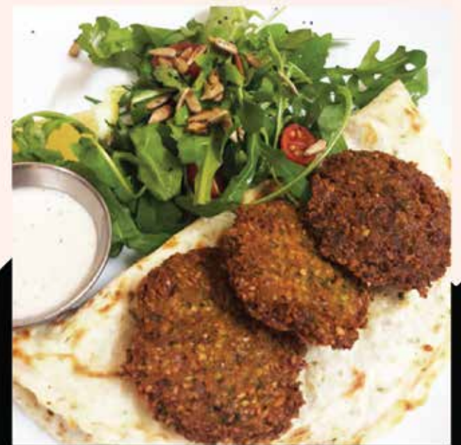
FALAFEL WRAP 15 HOME-MADE FALAFEL WITH ROCKETS, ONION, TOMATO, CHEESE, TAHINI AND YOGURT SAUCE