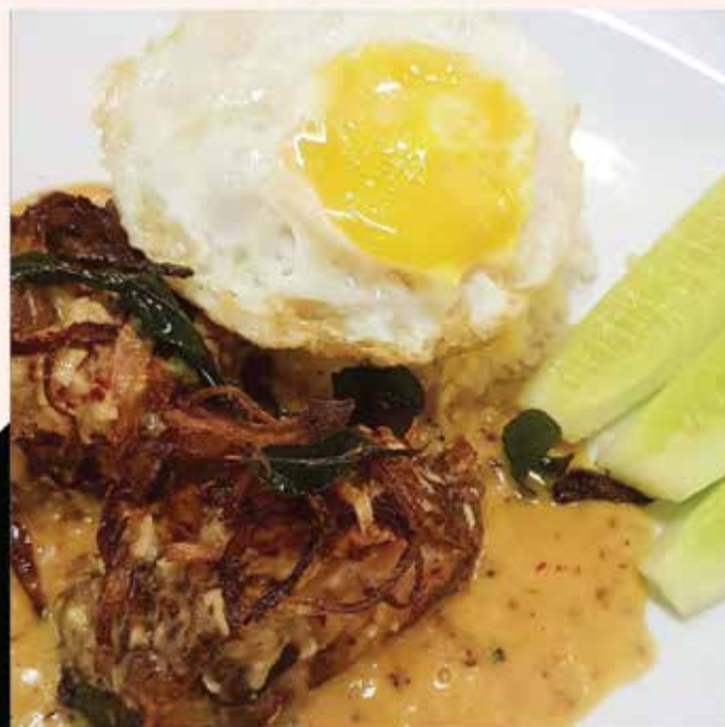
SPICY GARLIC BUTTER CHICKEN RICE 18