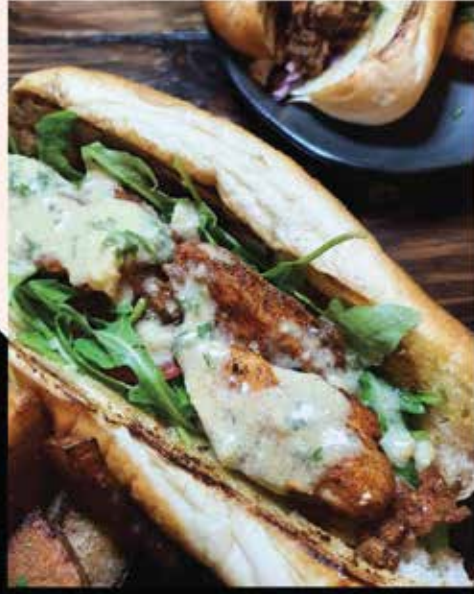
GARLIC BUTTER CHICKEN SANDWICH 16 WITH WATERCRESS, ONION, TOMATO