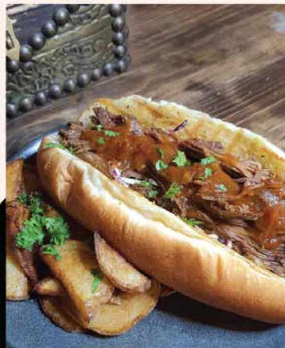
BBQ PULLED BEEF SANDWICH 18 PULLED AUSTRALIAN BEEF, STICKY BBQ SAUCE, COLESLAW