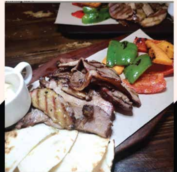
100g LAMB SLICE 16 WITH GRILLED VEGE, PITA BREAD AND GARLIC MAYO