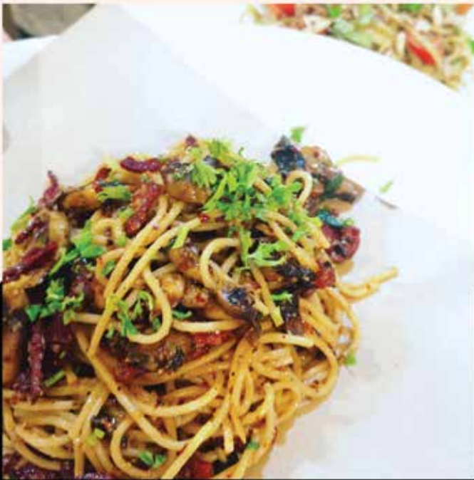
SPAGHETTI BEEF STRIPS 17 SPAGHETTI, BASIL, MUSHROOM, GARLIC & CHILLI