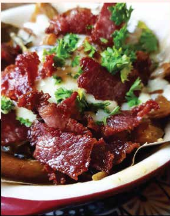
CHIPS, GRAVY & BEEF STRIPS 14