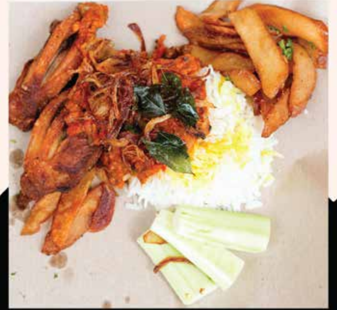
CHICKEN GULF RICE 18 BASMATI RICE, HOUSE-MADE SAMBAL, CURRY, FRIED CHICKEN, FRIED ONION & CURRY LEAVES